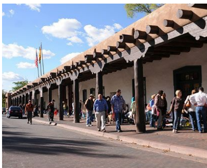
The Plaza in Santa Fe

The Native American Art Council announces a November 10-15 trip to three Rio Grande pueblos and galleries and museums in Santa Fe. The Council is partnering on this trip with South of the Border Tours in Tucson, Arizona.