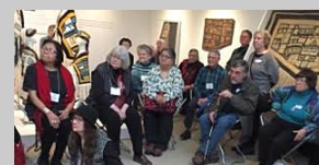
NAAC members at CCNA