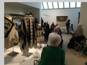
NAAC members at CCNA