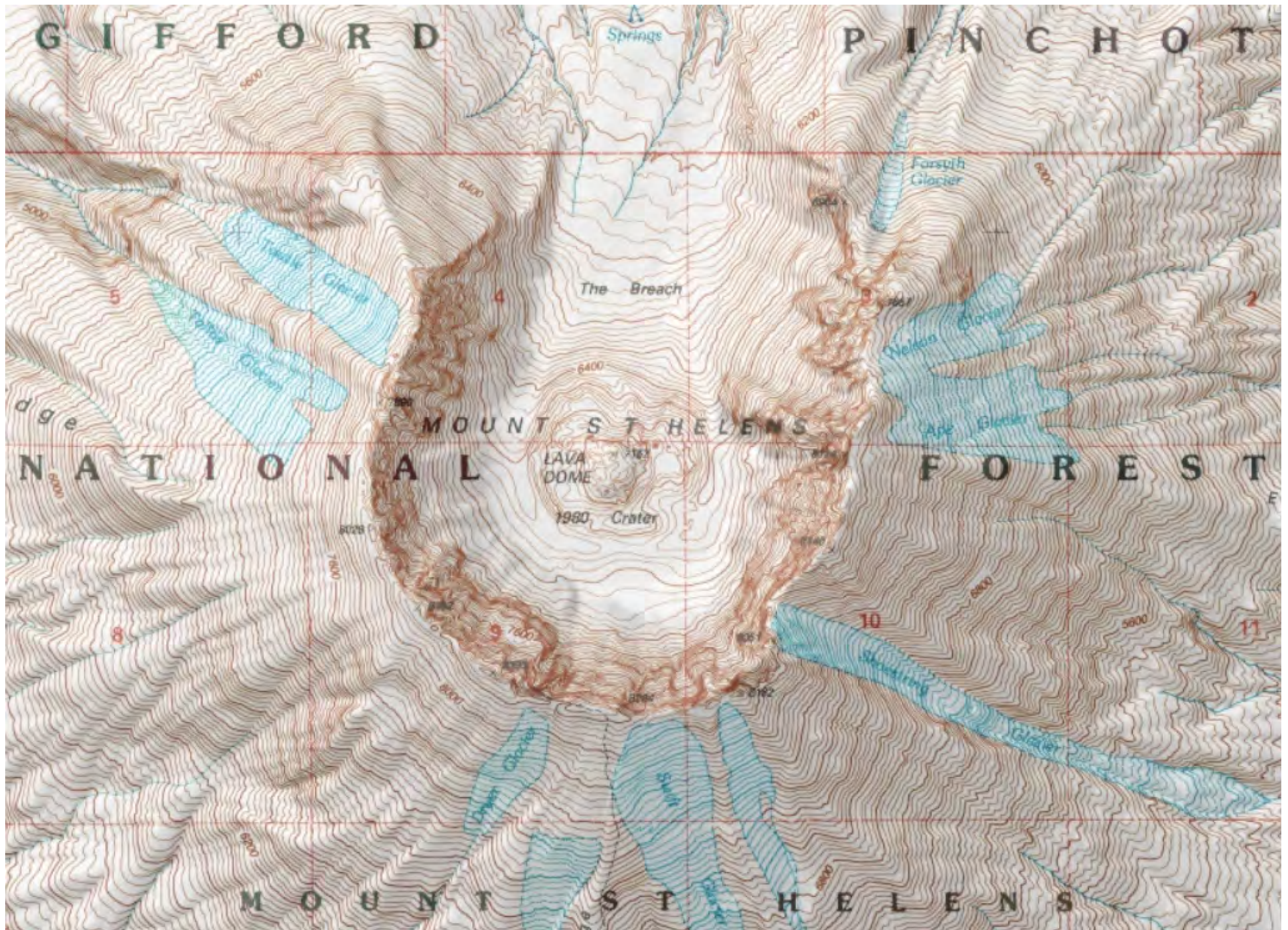
Topographical Map Post-Explosion Taken from USGS 1:24000-scale Quadrangle for Mount St. Helens, WA 1983