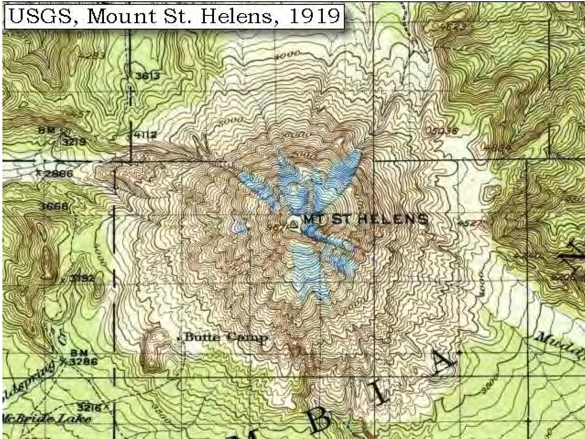
Map Pre-Explosion