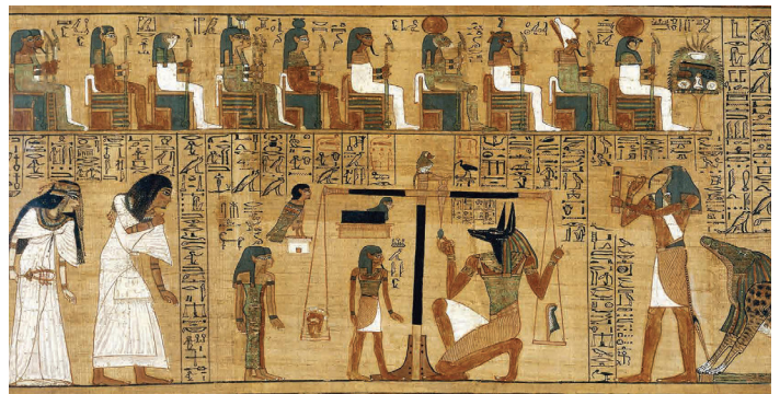
Papyrus from the Book of the Dead illustrating the weight of the heart, Thebes, 1275 BCE