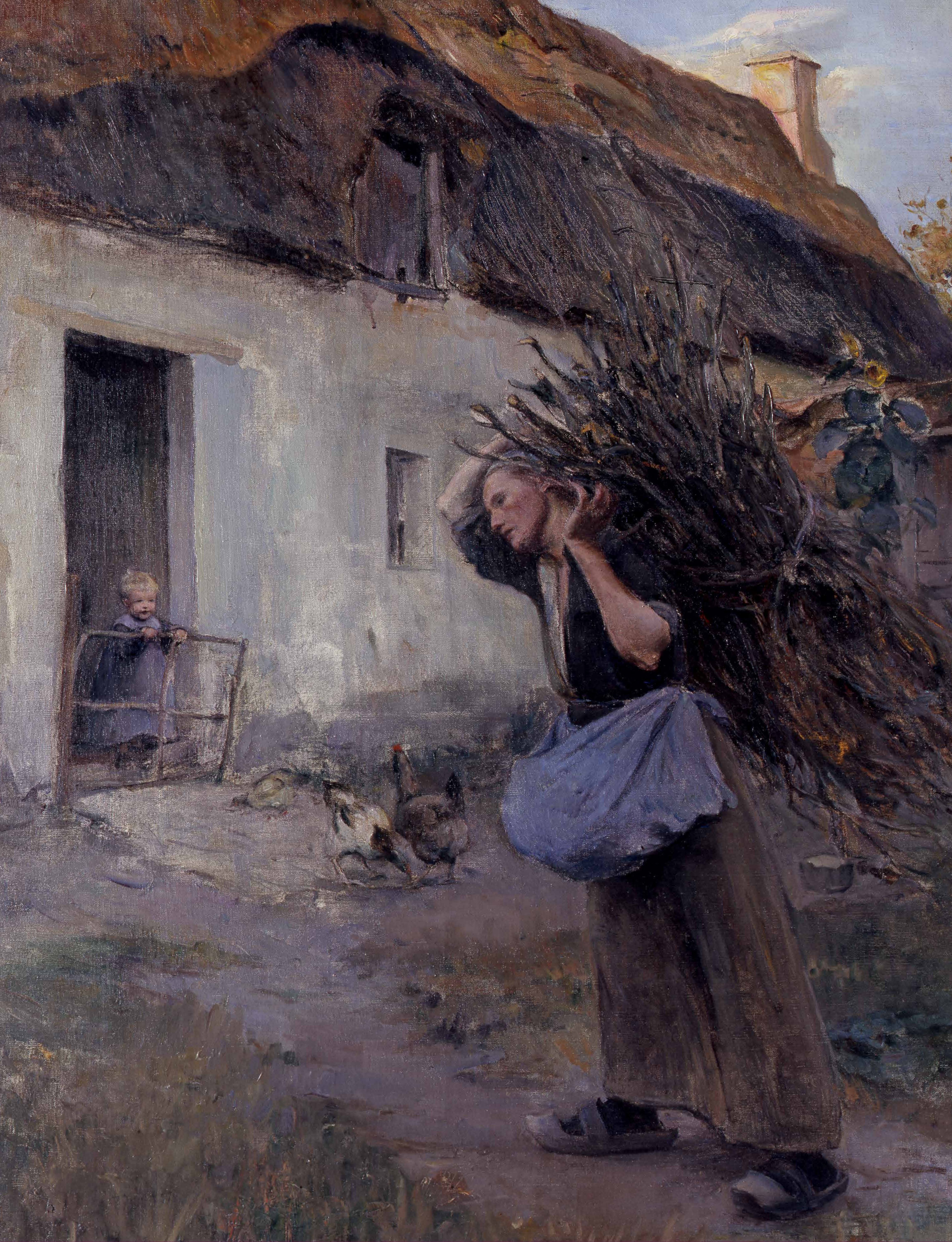
Elizabeth Nourse, Femme aux Fagots ( Woman with a Bundle of Sticks ), ca. 1899