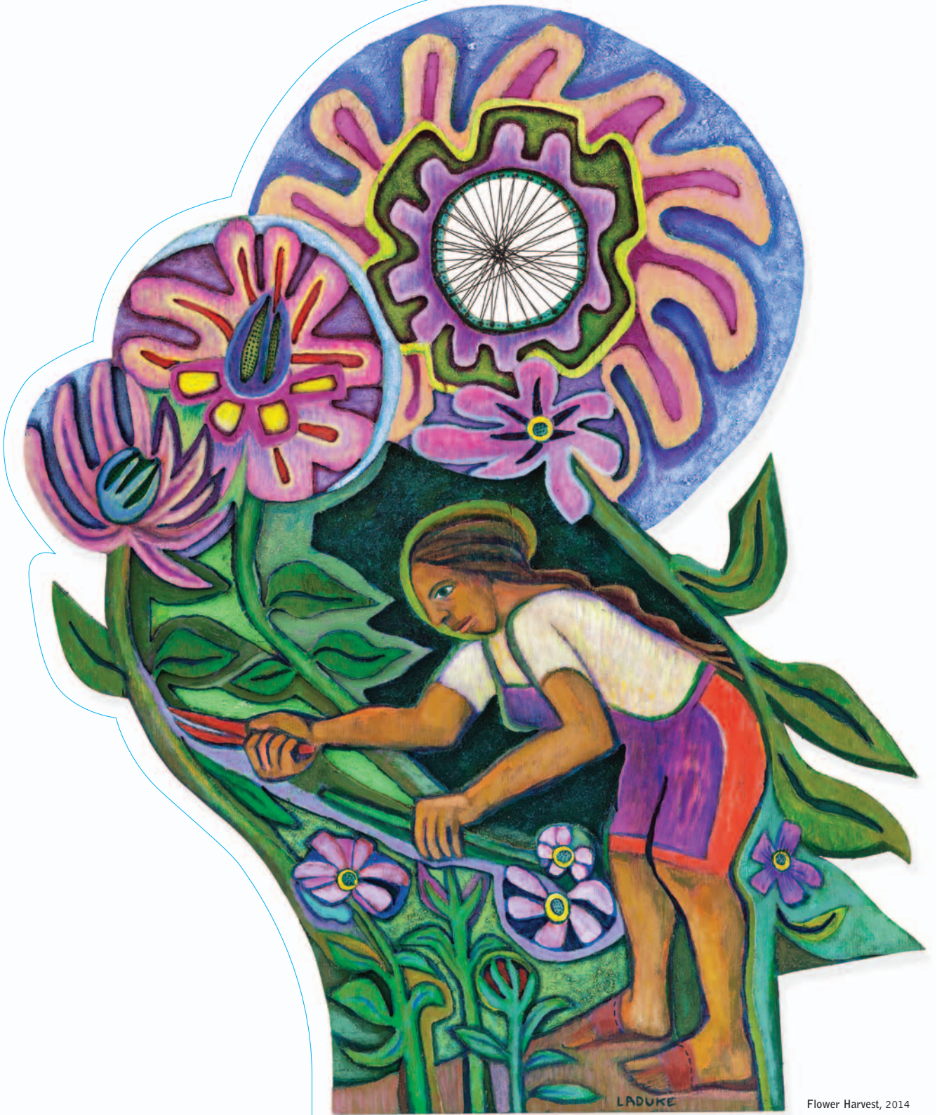
Flower Harvest, 2014