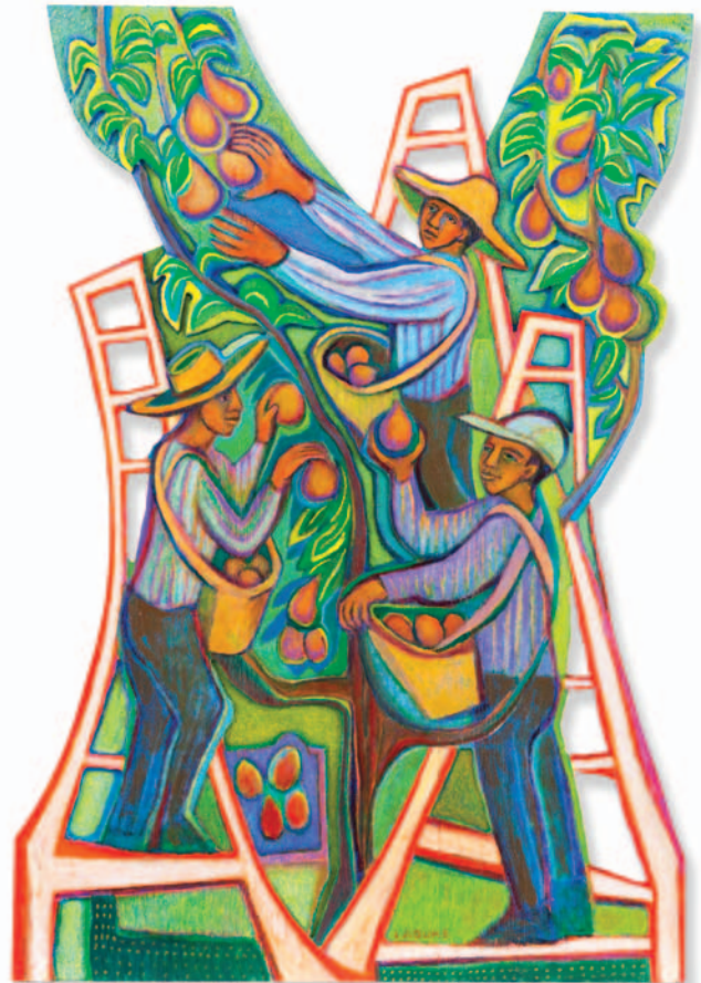
Pear Harvest Dptych, 2012