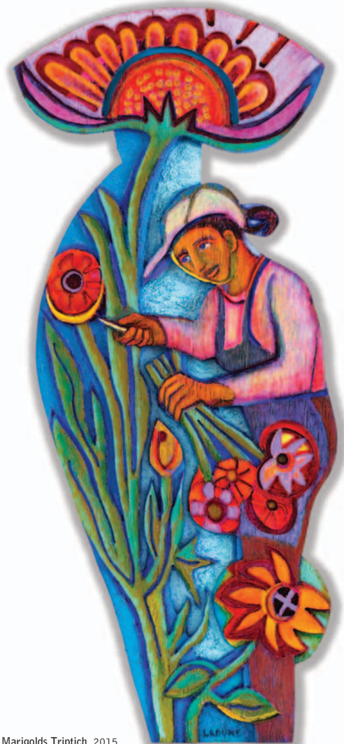
(detail) Marigolds Triptych, 2015

LaDuke's work is illustrative and documentary, political and spiritual. It is not an art for art's sake like the Abstract Expressionism, Pop Art, and Minimalist movements that reigned supreme during the artist's formative years. From 1953 through the 1970s, LaDuke claimed a position cognizant of, but outside the dominant spectrum of modern art, even though stylistic nods