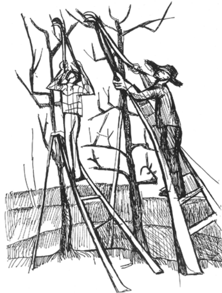
Sketch: Pear Tree Pruning, 2014