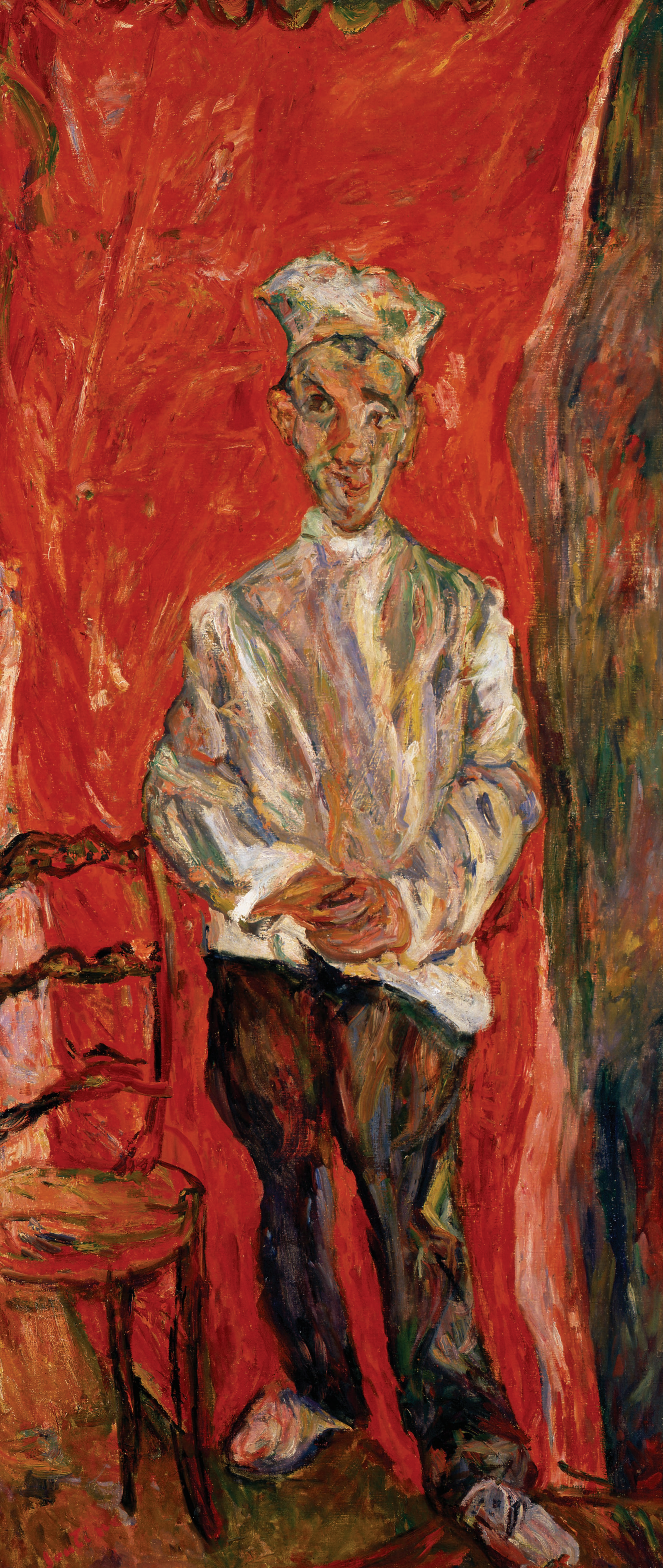
Chaim Soutine, Le Petit Pâtissier (The Little Pastry Cook), ca. 1921